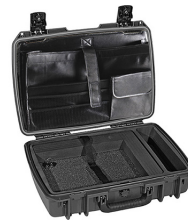
iM2370-X0003 Computer Case Deluxe