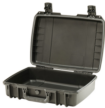
iM2370-X0000 No Foam